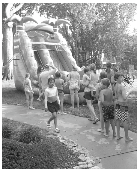
A water slide proved to be a hit with young neighbors at the Northwood Trails Beach Bash.

Looking ahead, we're excited to announce our Fall BBQ Competition! Neighbors will go head to head for bragging rights and titles such as Best Dessert, Best Beef and Best Pork. The date is still to be determined (don't worry, we'll make sure it doesn't